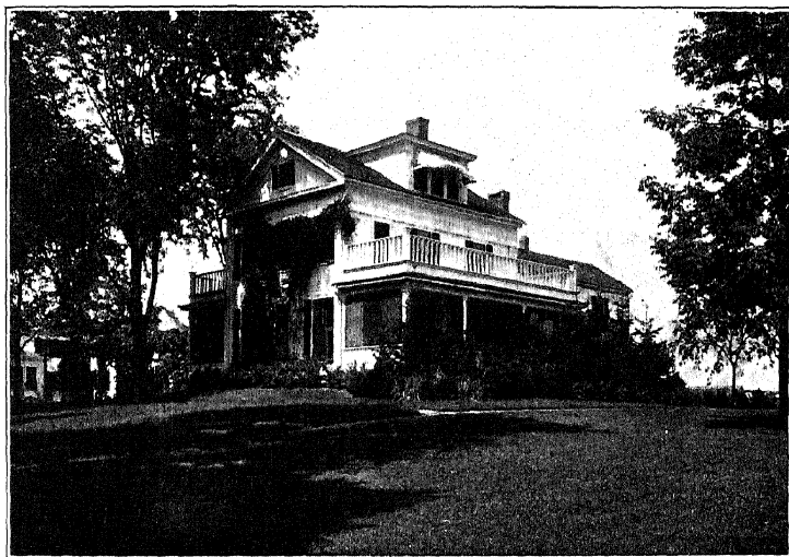
Miss Keller's home at Wrentham. Above, the entrance, showing the stone wall which Miss Keller helped build.